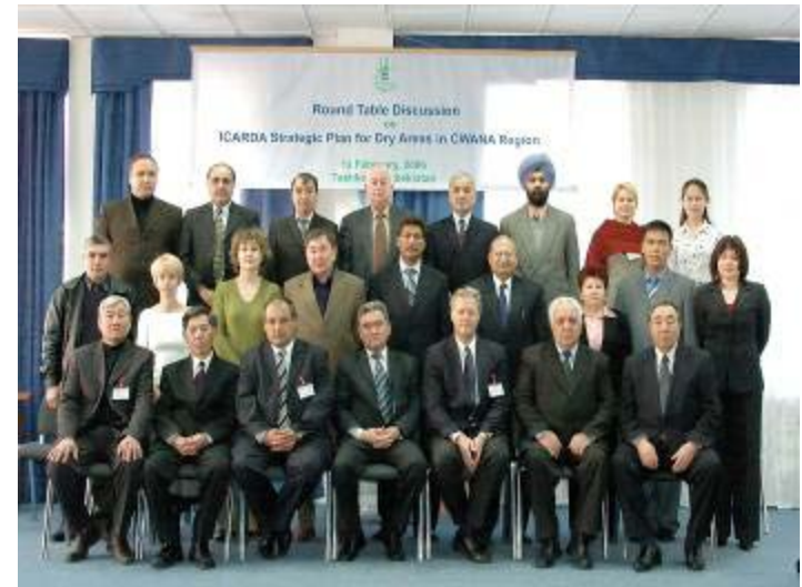
ICARDA-CACAARI Round Table Discussions on Strategic Plan for Dry Areas in CWANA region held in Tashkent, Uzbekistan, on 12 February, 2006.

2003, May 22-24, Second Triennial GFAR Conference, Dakar, Senegal