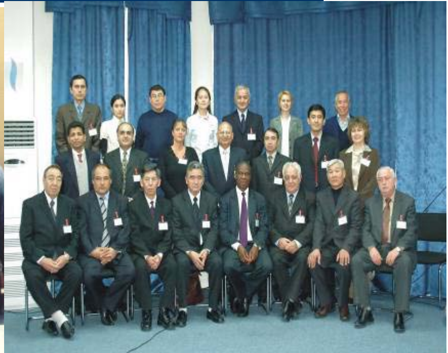
IFPRI – CACAARI workshop on “Reorienting Research Management and Agricultural Innovation System in Central Asia and the Caucasus” in Tashkent, Uzbekistan, on 10-11 February, 2006