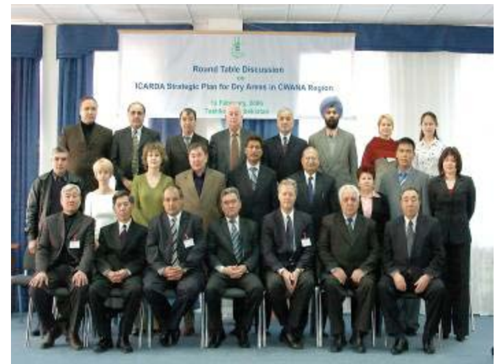
ICARDA-CACAARI Round Table Discussions on Strategic Plan for Dry Areas in CWANA region held in Tashkent, Uzbekistan, on 12 February, 2006.

2003, May 22-24, Second Triennial GFAR Conference, Dakar, Senegal