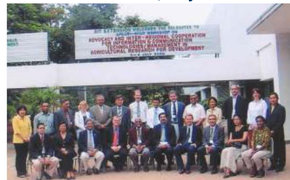
Inter-regional ICT workshop, 03-04 July, 2006 Bangkok, Thailand