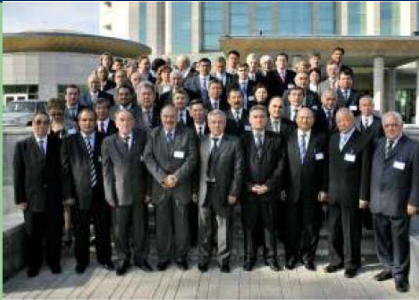
Expert Consultation on Regional Research Needs Assessment, 07-09 March, 2007, Tashkent, Uzbekistan