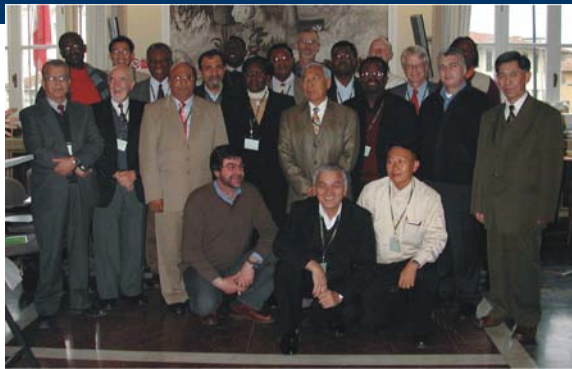
GFAR Retreat, 1-3 February, 2004, Italy, Florence