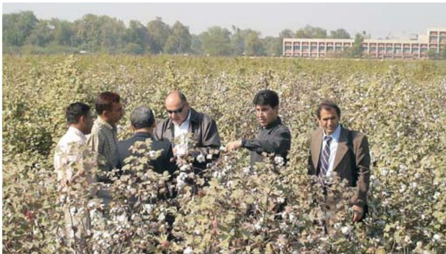
INCANA workshop on BT cotton, 21-26 November, 2005, India