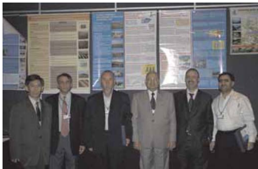
14 th Steering Committee Meeting of GFAR, 22-25 October, 2004, Mexico