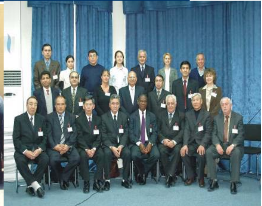
IFPRI – CACAARI workshop on “Reorienting Research Management and Agricultural Innovation System in Central Asia and the Caucasus” in Tashkent, Uzbekistan, on 10-11 February, 2006