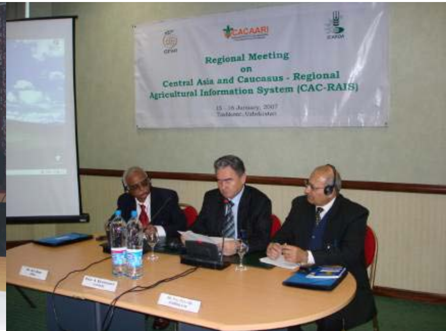
2-nd Meeting of CAC-RAIS 15-16 January, 2007 Tashkent, Uzbekistan

Participation Inter-regional RAIS meeting in Cairo, Egypt, in May, 2005