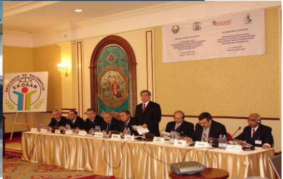
International Ecoforum on "Reorienting Agricultural Research to Achieve the MDGs" 17 January, 2007, Tashkent, Uzbekistan