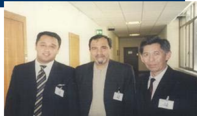
Meeting of with GFAR Executive Secretary, 17-18 of May, 2004, Rome, Italy