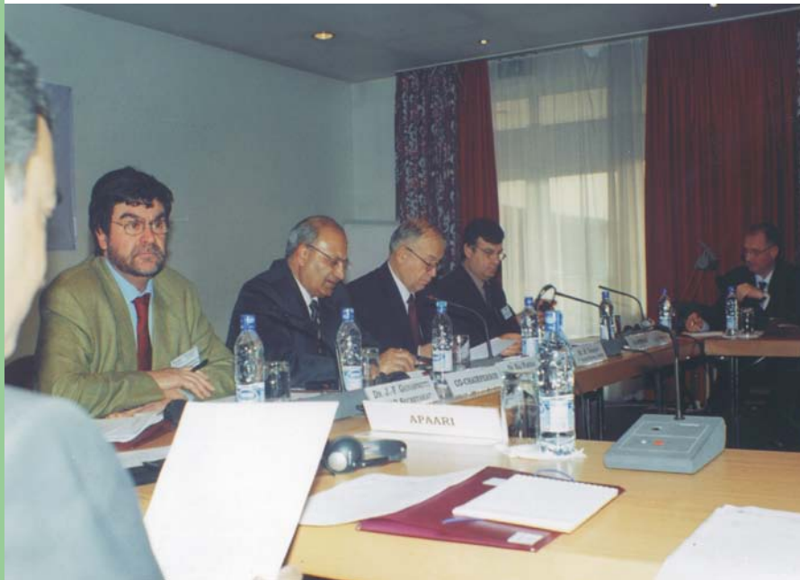
1-st Meeting of CAC-RAIS 27-28 January, 2004 Tashkent, Uzbekistan from