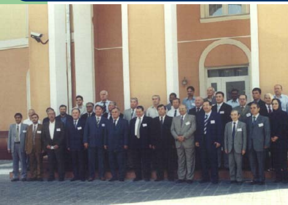
2nd INCANA Meeting, 6-8 September, 2004, Tashkent, Uzbekistan